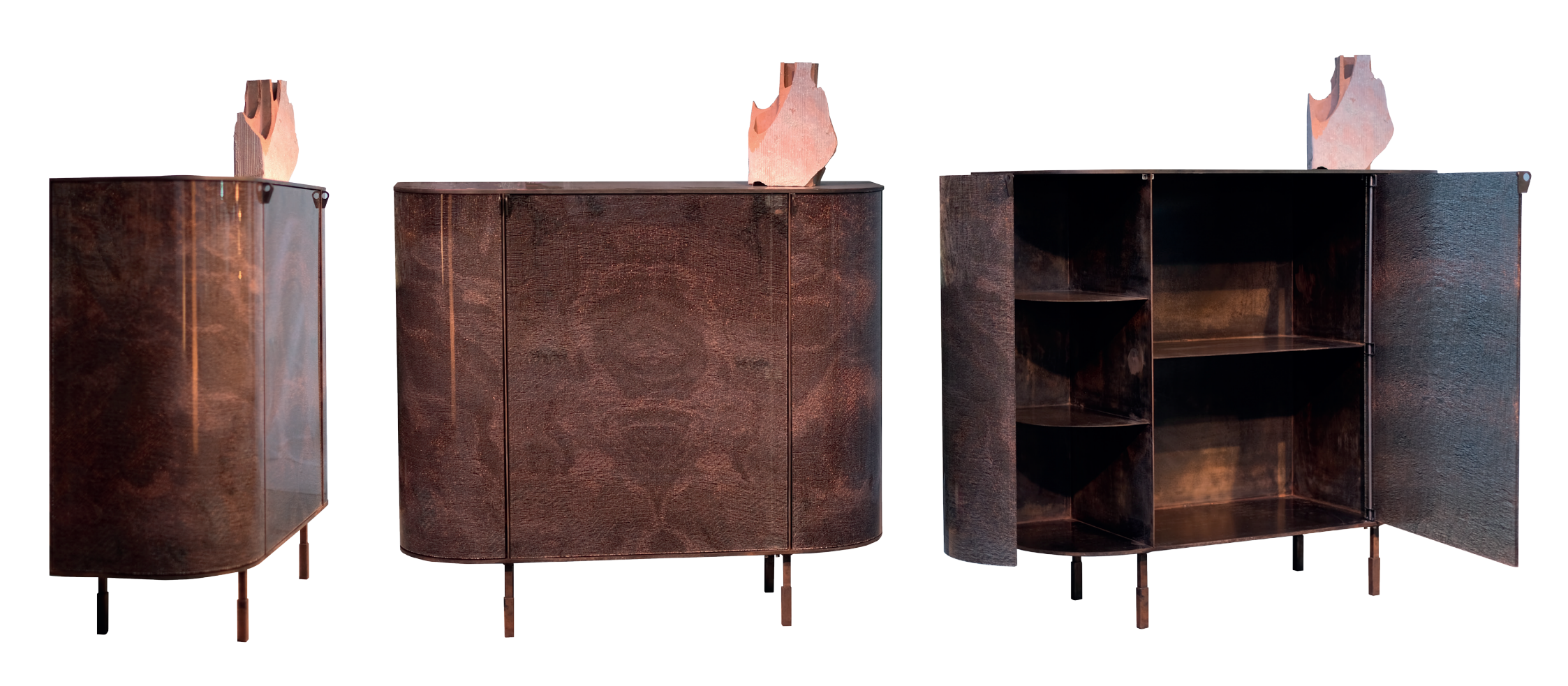
SUGI patinated steel, recycled plexiglass. H. 90 cm D. 38cm W. 101 cm