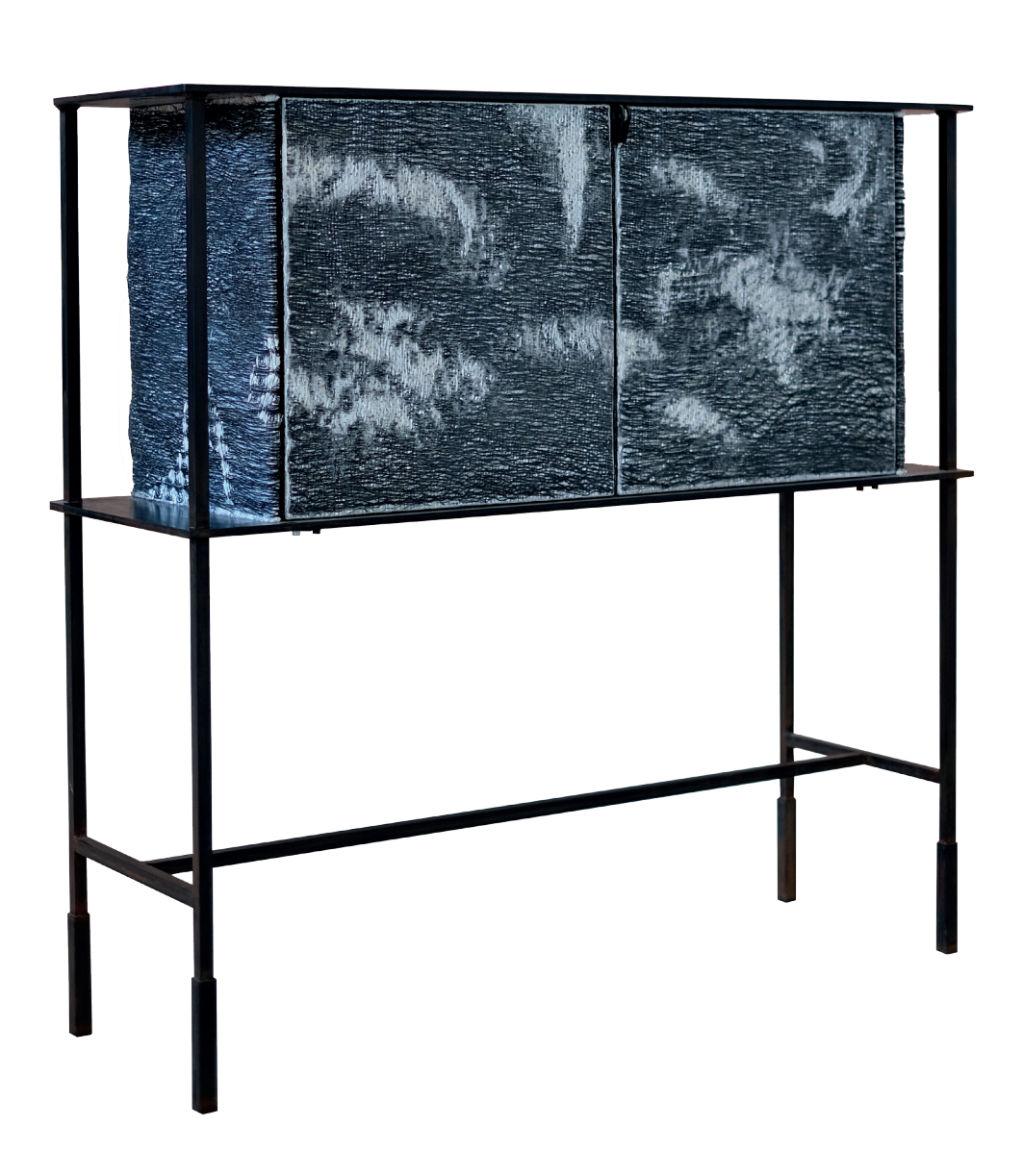
NIKKA patinated steel foot, solidified fabric by KRJST Studio with soja based resin. W. 102~{\rm cm} H. 100~{\rm cm} D. 34~{\rm cm}