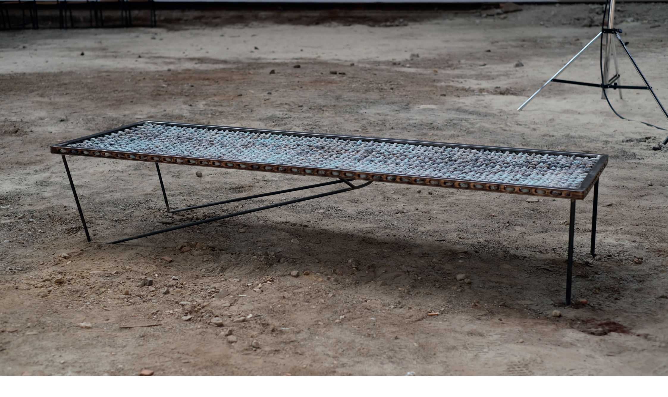
BENCH custom made rope by KRJST Studio, steel profile, hot drawn steel bar. H. 40,5 cm W. 70 cm D. 200 cm