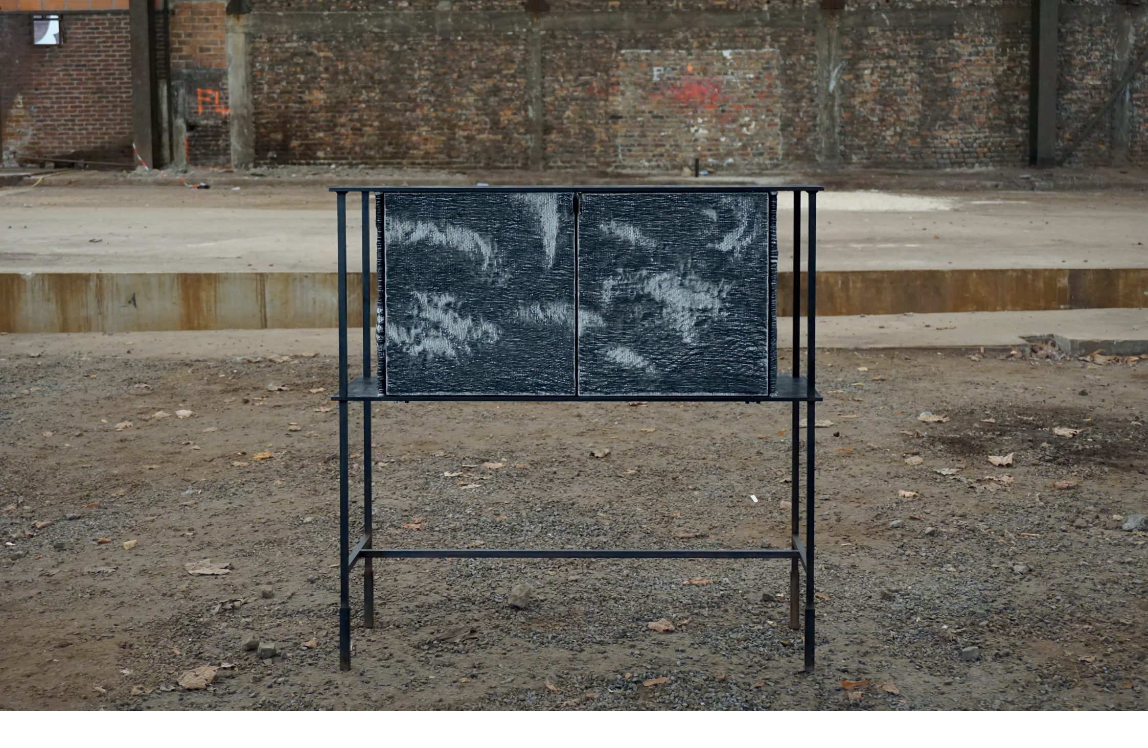
NIKKA patinated steel foot, solidified fabric by KRJST Studio with soja based resin. W. 102 cm H. 100 cm D. 34 cm